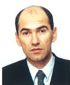
Janez Janša - SDS