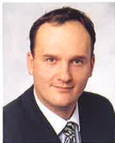
Janez Podobnik, deputy chairman - SLS+SKD Slovene People's Party