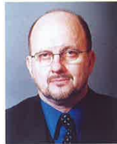
Zmago Jelinčič Plemeniti, deputy chairman - SNS