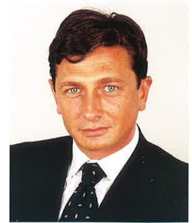
Borut Pahor, President of the National Assembly of the Republic of Slovenia

The term of a deputy lasts four years. Elections to the National Assembly are called by the President of the Republic.