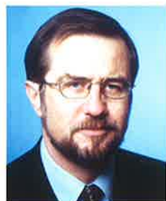
Alojz Peterle - NSi

LDS - Liberal Democracy of Slovenia, SDS - Social Democratic Party, ZLSD - United List of Social Democrats, NSi - Nova Slovenija, DeSUS - Democratic Party of Pensioners of Slovenia, SNS - Slovene National Party, SMS - Slovene Youth Party