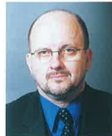
Zmago Jelinčič Plemeniti - SNS