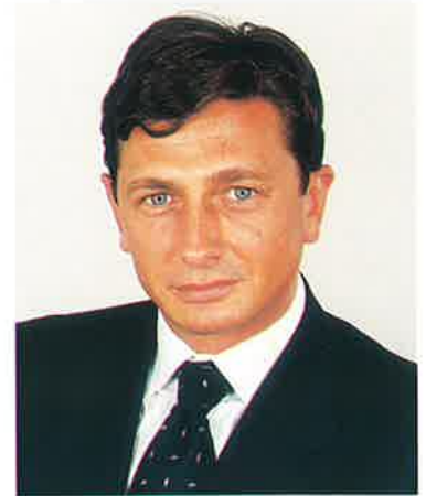
Borut Pahor, President of the National Assembly of the Republic of Slovenia

The term of office of a deputy lasts four years. Elections to the National Assembly are called by the President of the Republic.