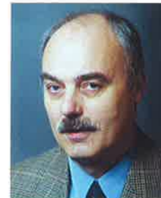
Rudolf Petan, Committee chairman - SDS

The Chairman of the Committee on Defence for the 2000-2004 term is Rudolf Petan (Social Democratic Party); the deputy chairman of the committee is Dorijan Maršič (Liberal Democracy of Slovenia).