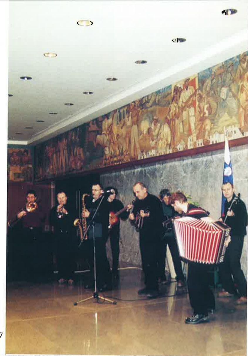
The Orlek group