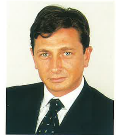
Borut Pahor, President of the National Assembly of the Republic of Slovenia

The term of office of a deputy lasts four years. Elections to the National Assembly are called by the President of the Republic.