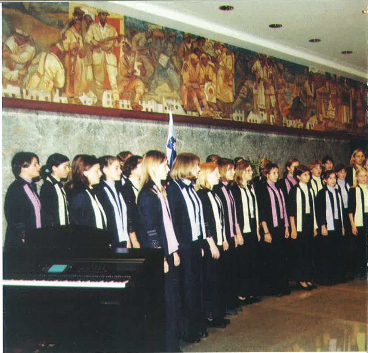
The Vesna girl chorus

The Committee also comprises a Working Group on Language Planning and Language Policy, consisting of renowned Slovene linguists and other experts. The working group deals with linguistic problems arising in legislative work and other issues related to the use and status of Slovene as an official and national language. The working group implements its proposals, positions and decisions through the decisions of the Committee and the National Assembly or informs the relevant bodies and the general public thereof.