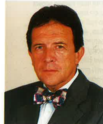
Vice-President of the National Assembly of the Republic of Slovenia Dr. Miha Brejc (SDS)