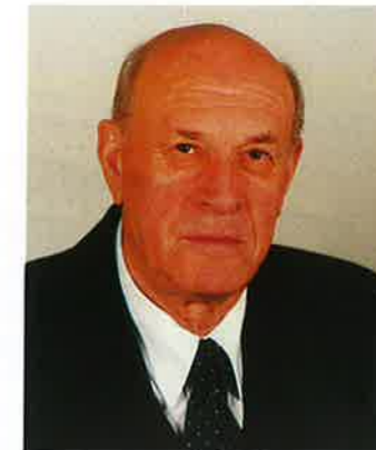
Vice-President of the National Assembly of the Republic of Slovenia Anton Delak (DeSUS)