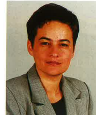
Vice-President of the National Assembly of the Republic of Slovenia Irma Pavlinič Krebs (LDS)