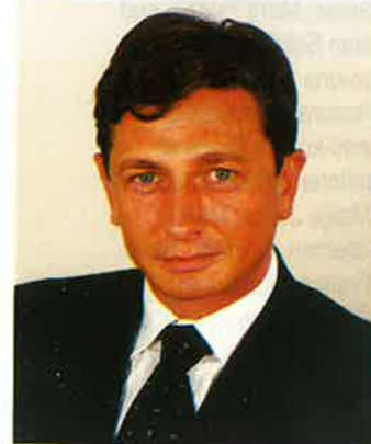
President of the National Assembly of the Republic of Slovenia Borut Pahor (ZLSD)